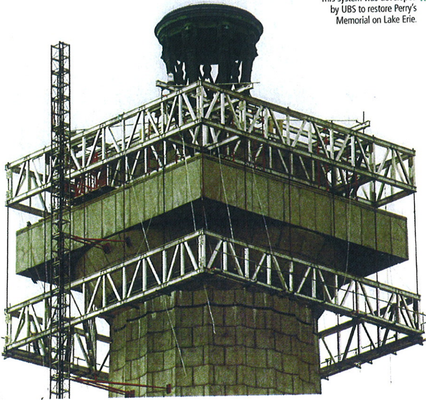
This system was developed by UBS to restore Perry's Memorial on Lake Erie.