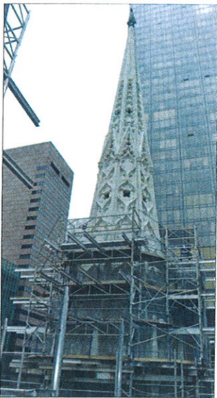
Carpenter scaffolding inside St. Patrick's Cathedral (right).

More than forty Local Union 1556 carpenters have been part of an unprece- dented refurbishing job at St. Patrick's Cathedral.