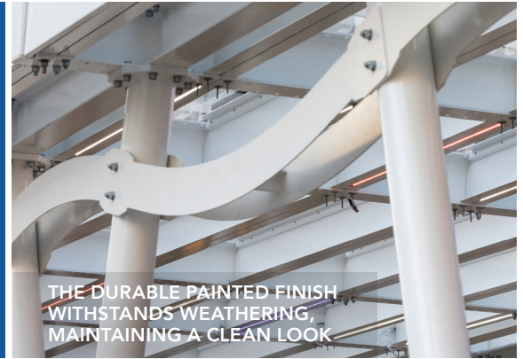
THE DURABLE PAINTED FINISH WITHSTANDS WEATHERING, MAINTAINING A CLEAN LOOK

The community at large benefits from an appealing contemporary look that preserves the integrity of their neighborhood and business environment while keeping the public safe from falling debris.