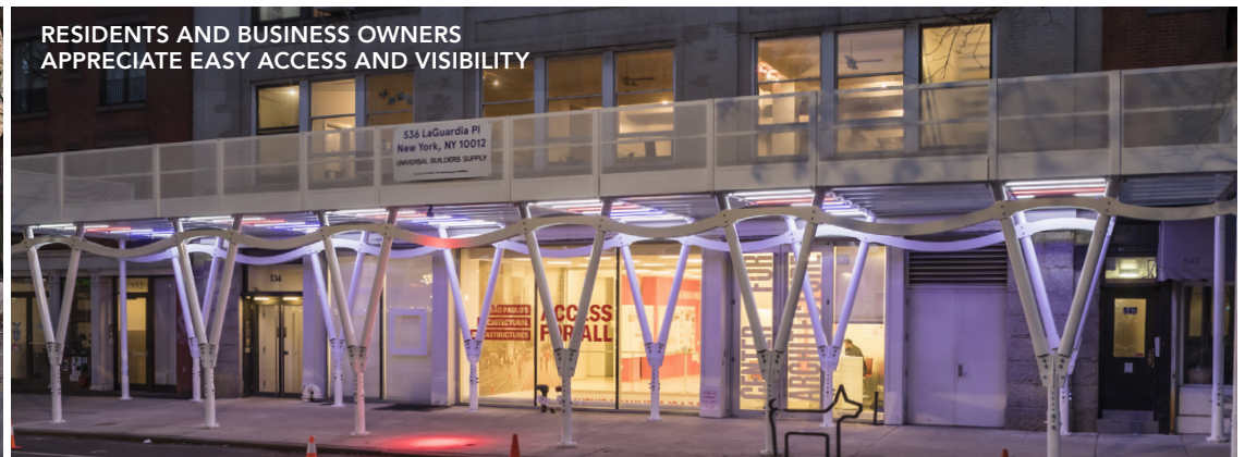
RESIDENTS AND BUSINESS OWNERS APPRECIATE EASY ACCESS AND VISIBILITY