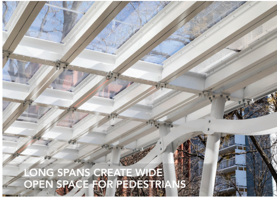
LONG SPANS CREATE WIDE OPEN SPACE FOR PEDESTRIANS

The community at large benefits from an appealing contemporary look that preserves the integrity of their neighborhood and business environment while keeping the public safe from falling debris.