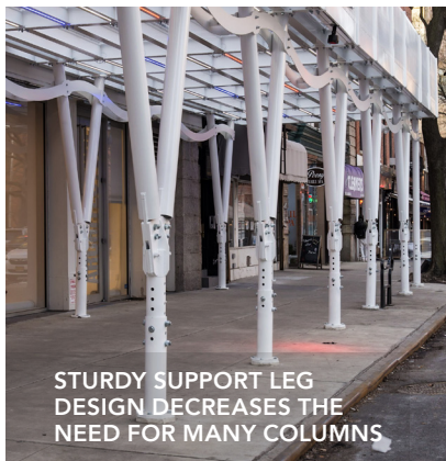
STURDY SUPPORT LEG DESIGN DECREASES THE NEED FOR MANY COLUMNS